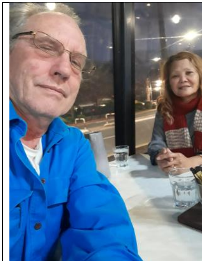
A recent photo of my wife and I on our 22 nd wedding anniversary.